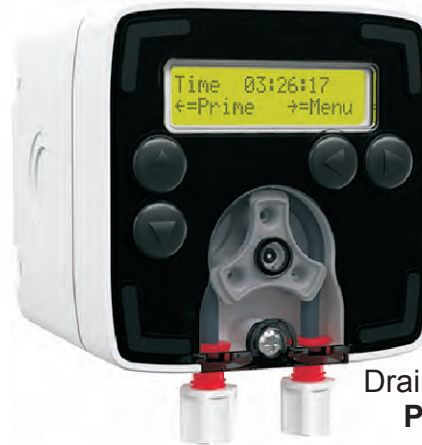
Drain Watch P9024