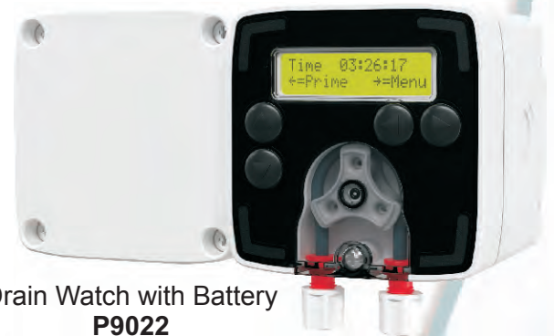
Drain Watch with Battery P9022